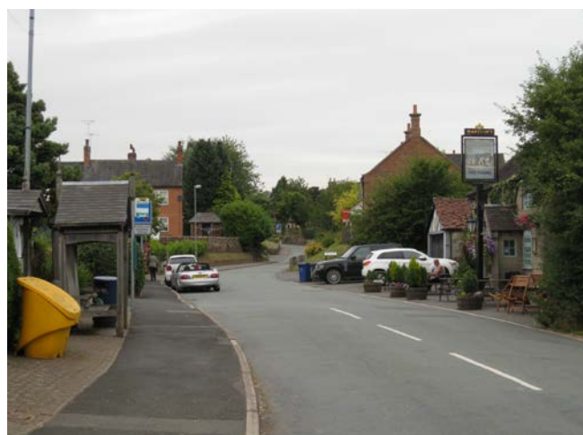
Figure 3 (top) What does the evidence tell us? Roundtable discussions on the local historic environment