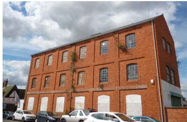
Figure 2 Newport Pagnell's Neighbourhood Plan allocated the former Aston Martin Motorcar Works site for housing development but also required the conservation and reuse of several historic factory buildings, including an unusual three-storey car factory building built in 1909

Whilst it can cover wider community aspirations, a neighbourhood plan should address the